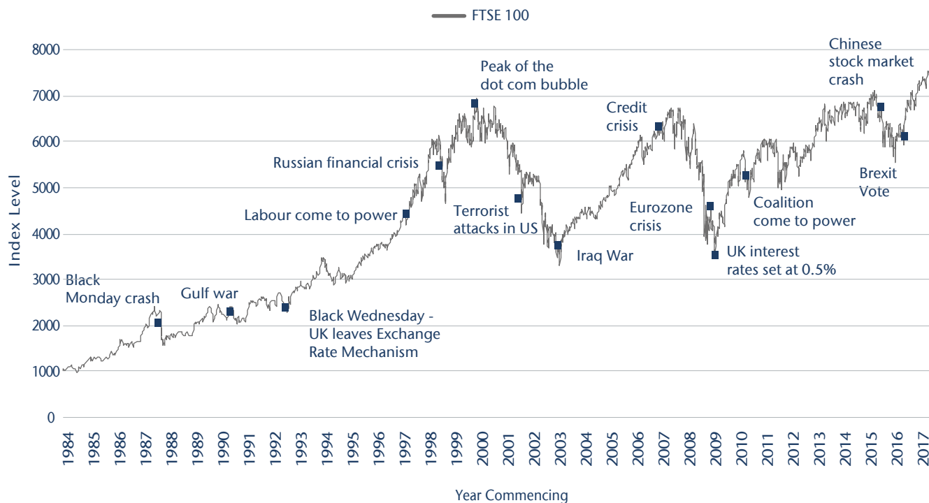
FTSE 100 Index